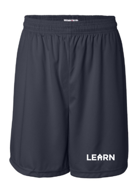
Phys Ed Shorts $18